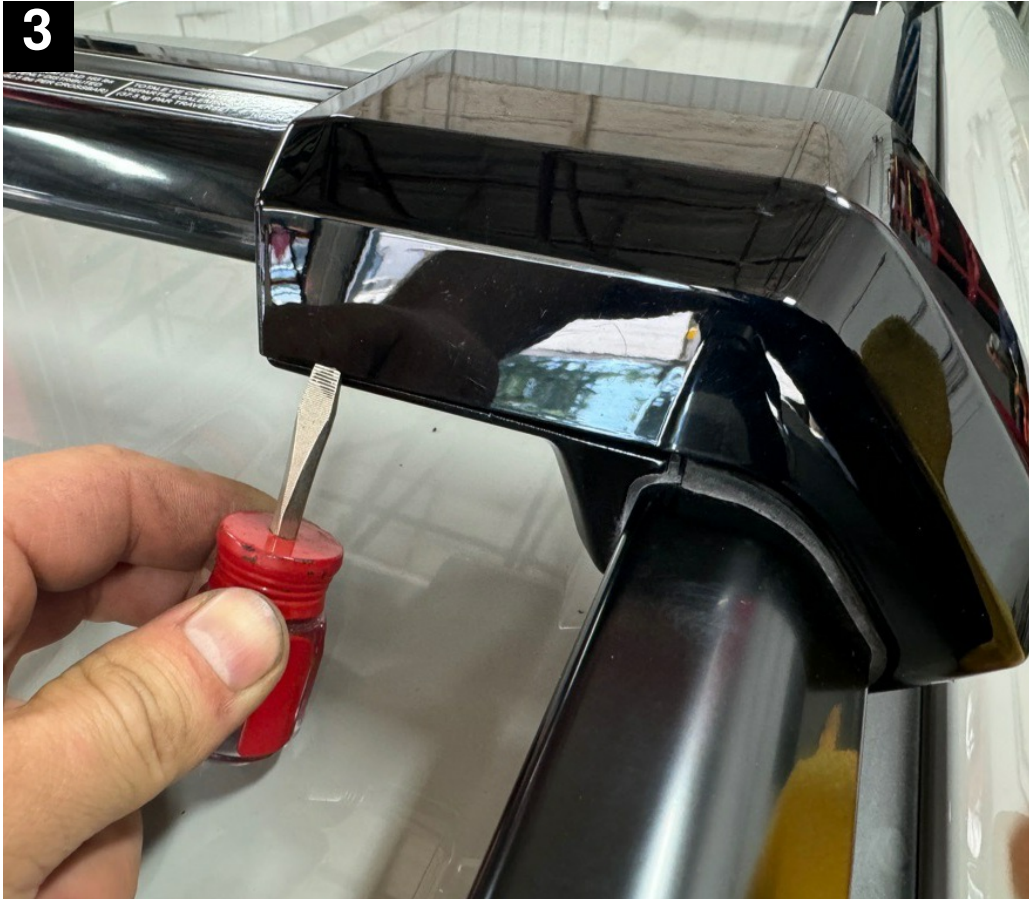
If equipped with factory cross bars you will need to remove the outer plastic caps as shown using a pry tool or flat screwdriver.