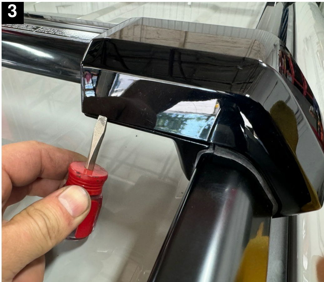
If equipped with factory cross bars you will need to remove the outer plastic caps as shown using a pry tool or flat screwdriver.