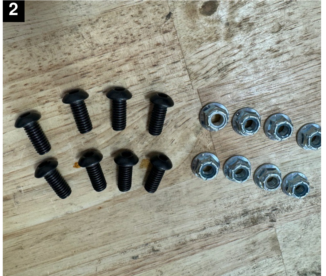
Included Parts: (1) Crossbar, (2) Inner mounting brackets, (2) Outer mounting brackets, (2) Adhesive rubber pads (8) 5/16-18x3/4" button head bolts, (8) 5/16-18 flanged nylon lock nuts.