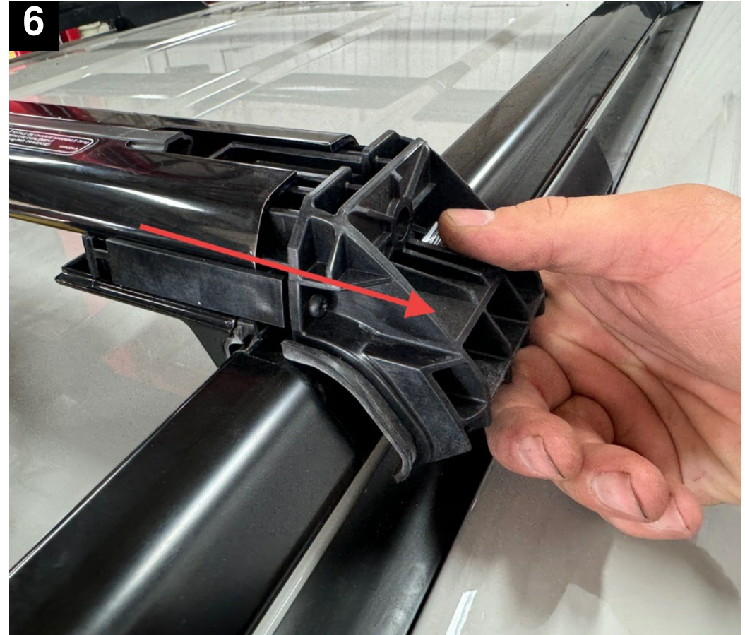
Then pull outward to release the cross bar from the rail. Repeat this step on the opposite side and lift off to remove the crossbar.