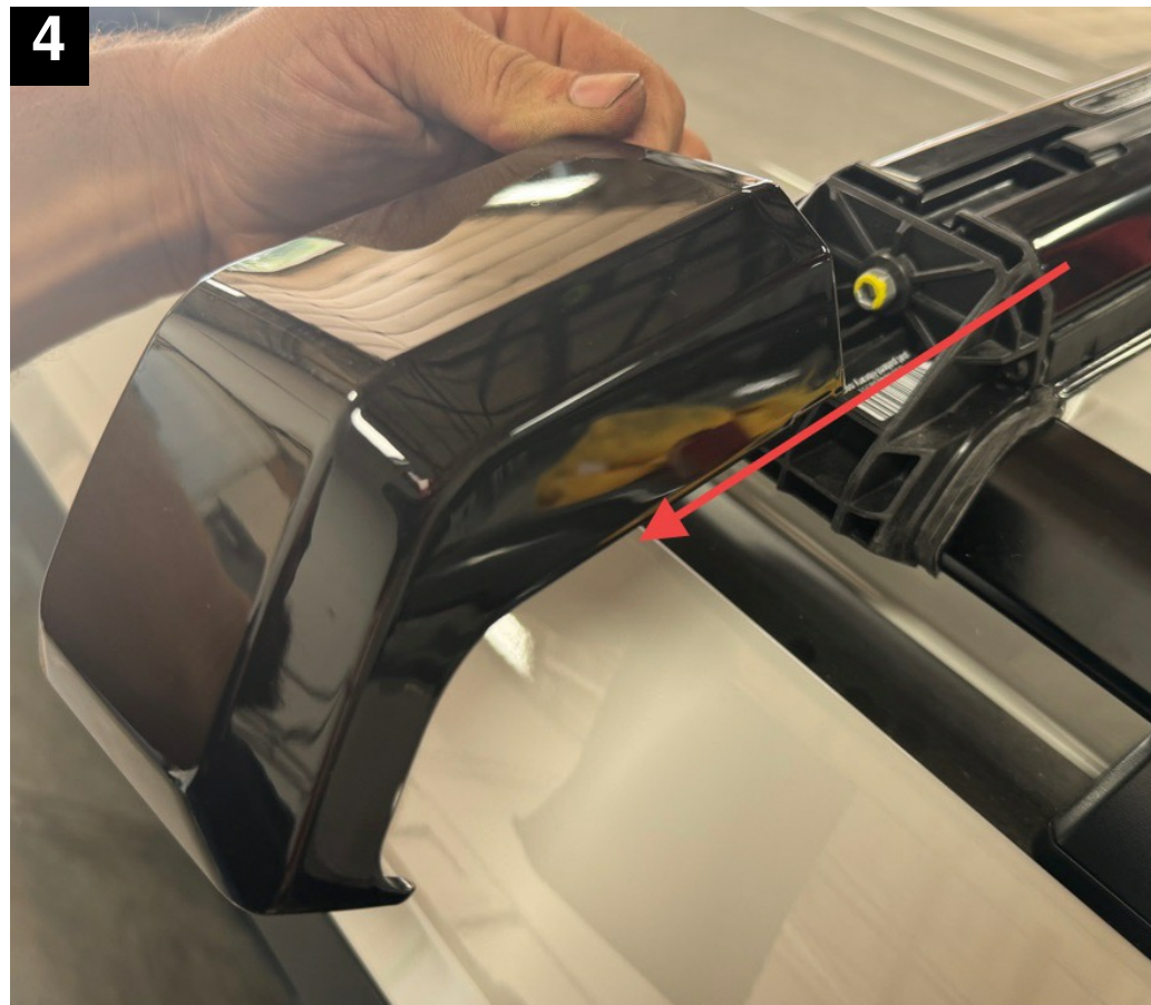
With the locking tabs released on both sides you will slide the covers outward to remove them.