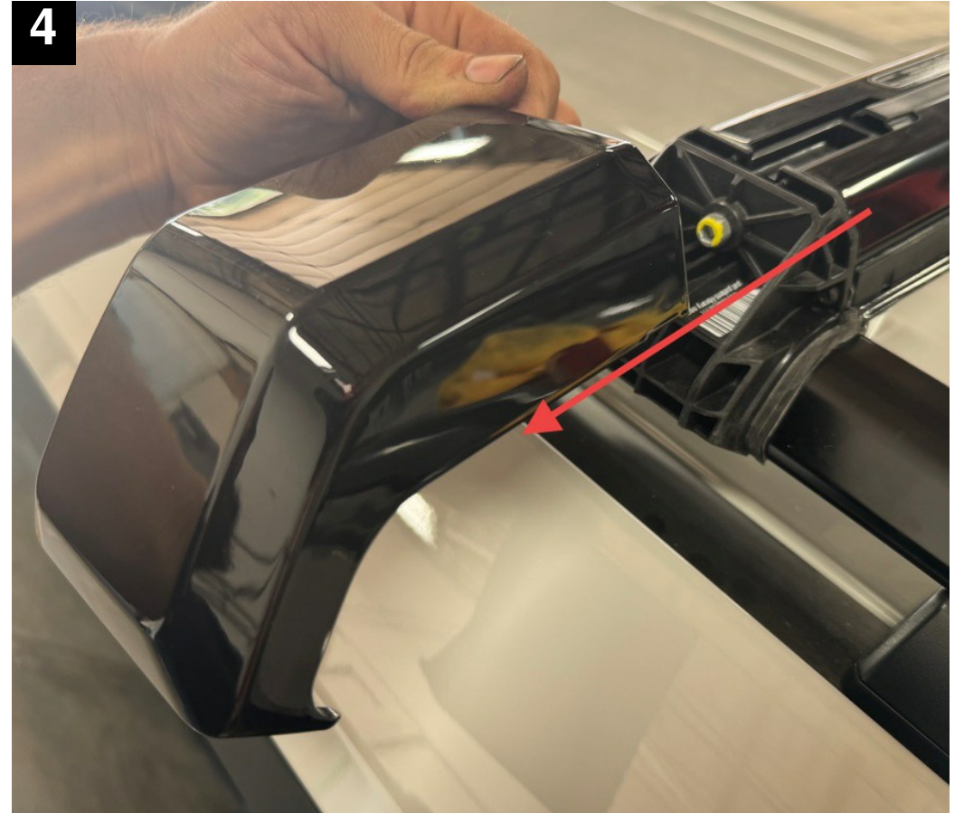
With the locking tabs released on both sides you will slide the covers outward to remove them.