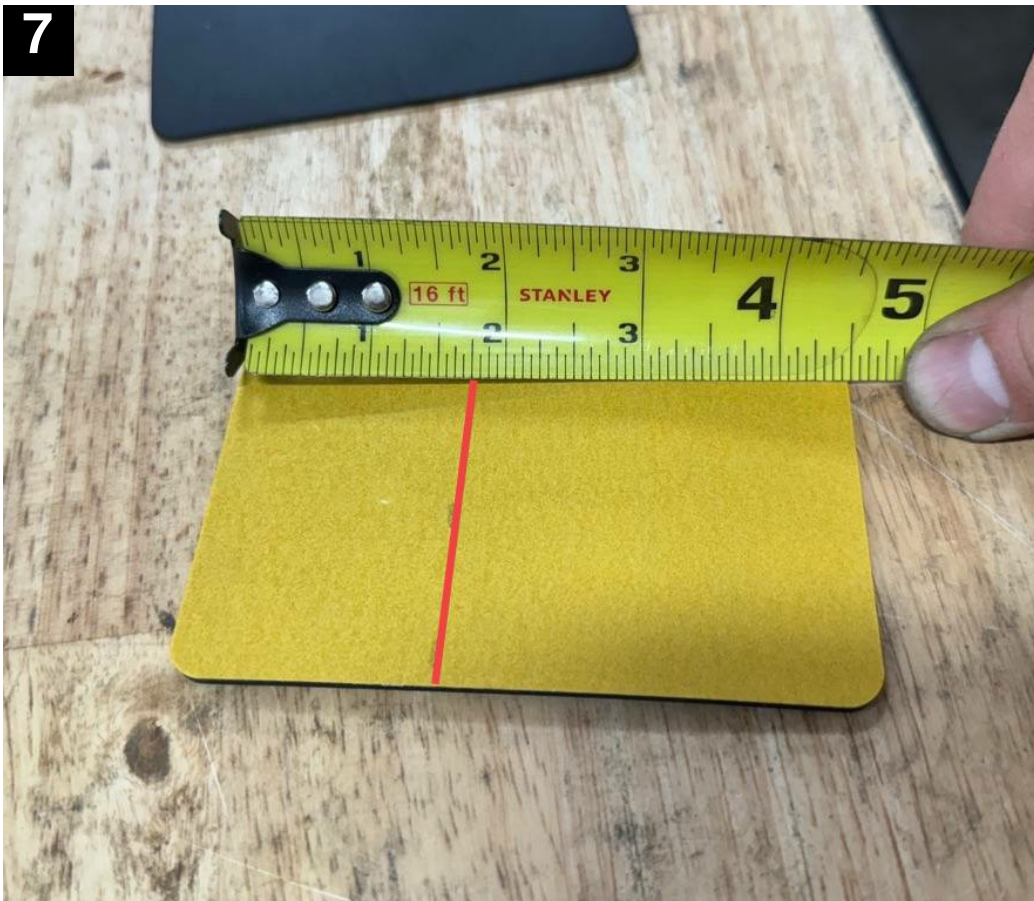
Mark each adhesive pad 1 \frac{3}{4} " in from the edge and draw a line across using a straight edge. (For reference the opposite end should measure 2 \frac{3}{4} " )