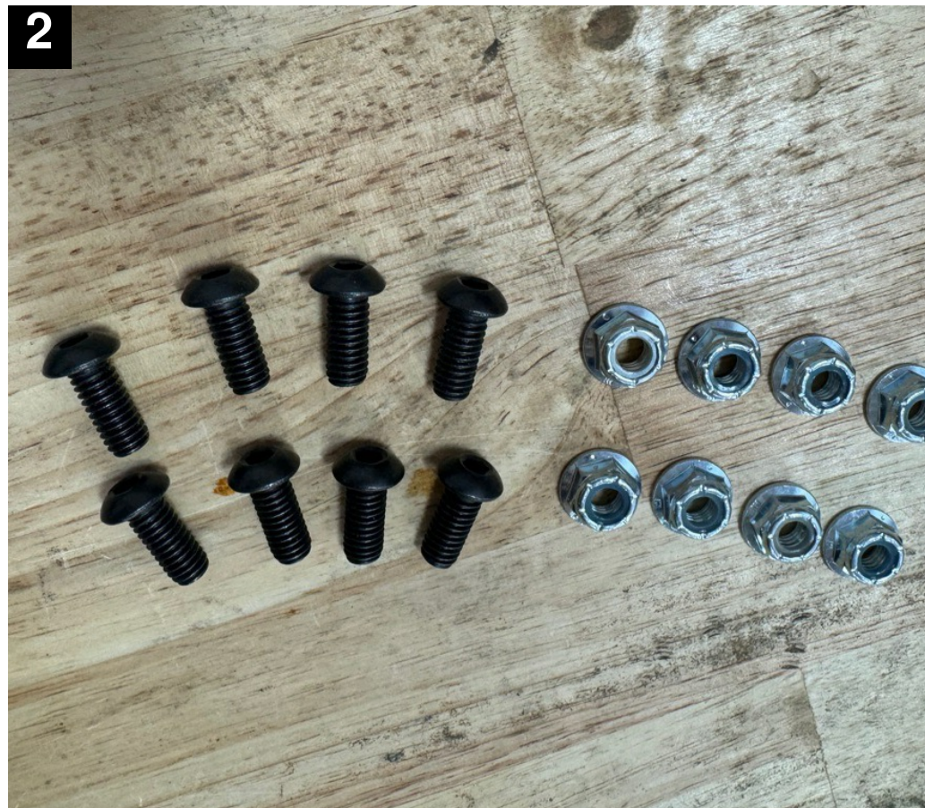
Included Parts: (1) Crossbar, (2) Inner mounting brackets, (2) Outer mounting brackets, (2) Adhesive rubber pads (8) 5/16-18x3/4" button head bolts, (8) 5/16-18 flanged nylon lock nuts.