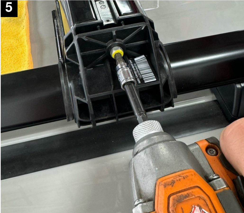
Next loosen the bolt shown using a 5mm hex or 10mm socket.