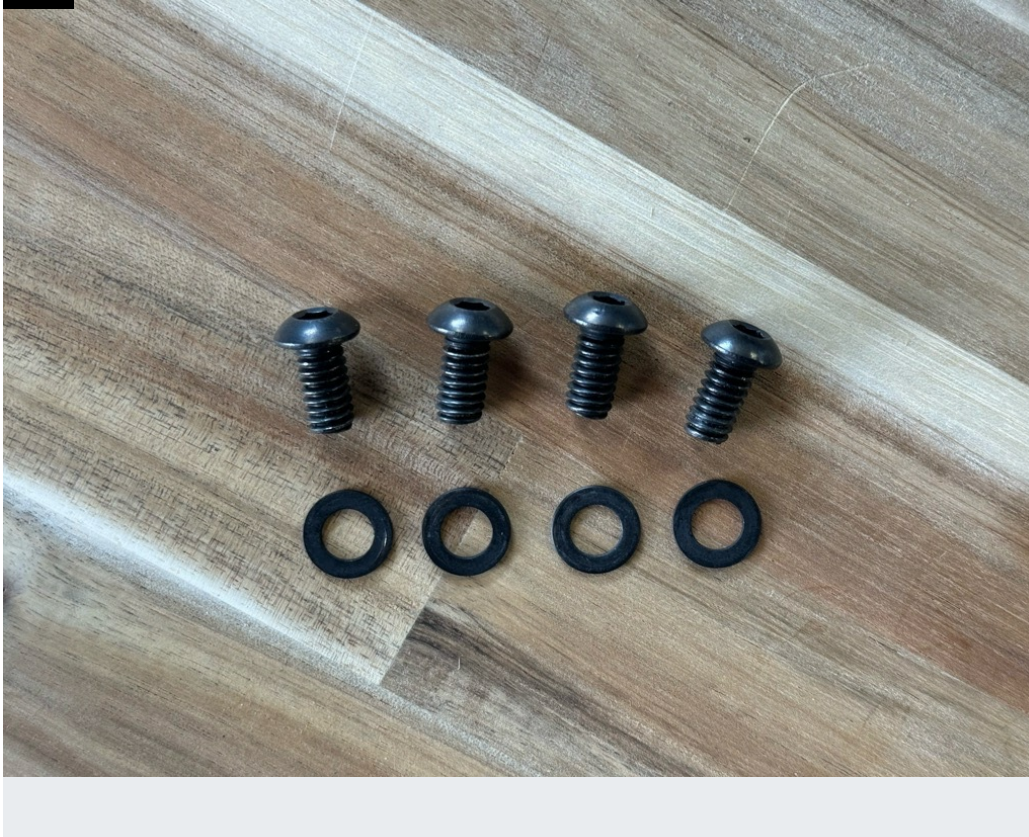
Included Hardware: (4) 1/4"-20 button head bolts, (4) 1/4" flat washers