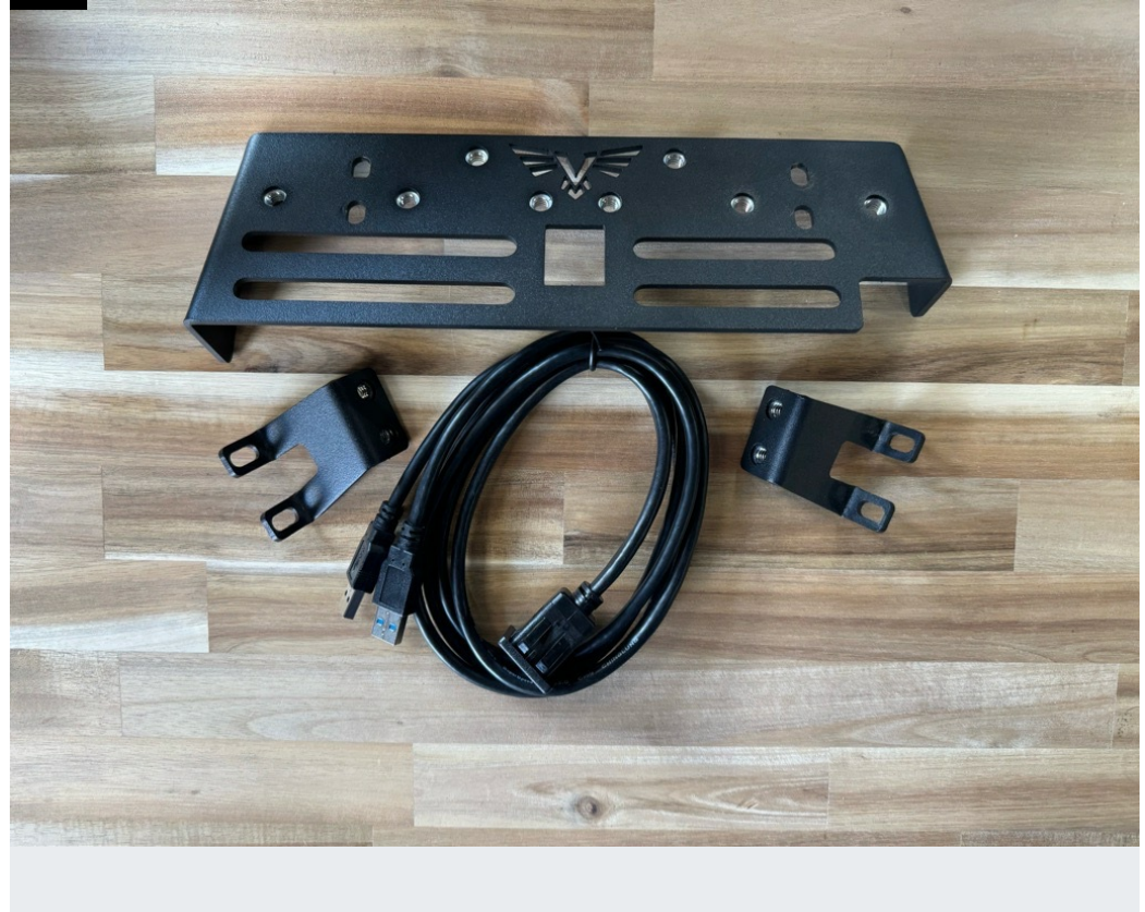
Included parts: (1) Accessory mounting plate, (2) mounting brackets, (1) Dual USB Cable