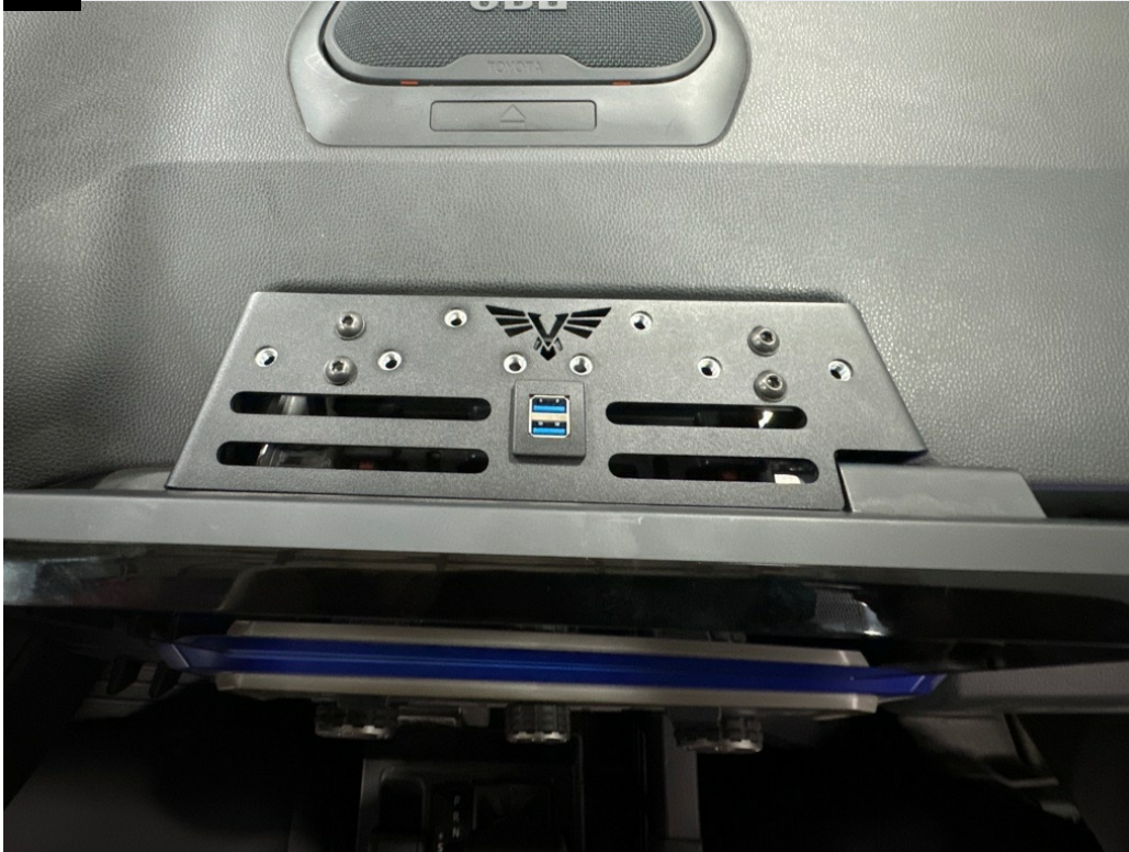
Completed installation shown