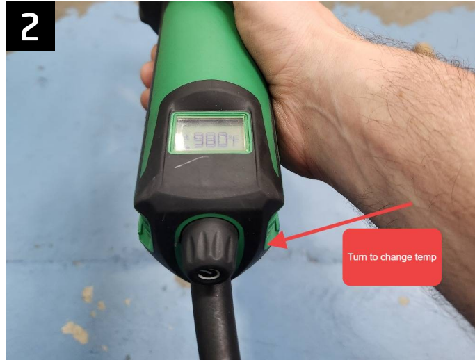
2 Turn dial to desired temperature.