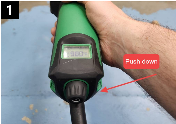
1 Ensure Liester is plugged in. Hold bottom button pressed in till you hear it turn on.