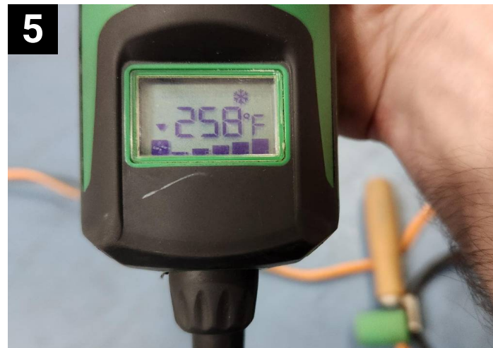
5 Place Liester away from everything it will turn off after the cooldown ends.