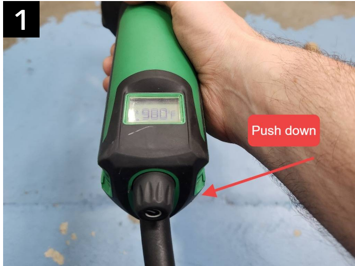
1 Ensure Liester is plugged in. Hold bottom button pressed in till you hear it turn on.