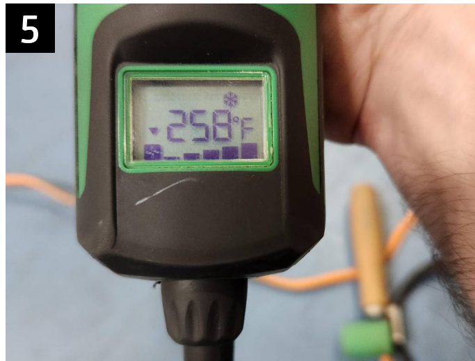
5 Place Liester away from everything it will turn off after the cooldown ends.