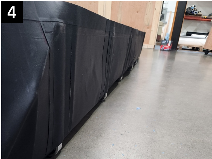
Pull out all walls so that they are flush with the deployed brackets.