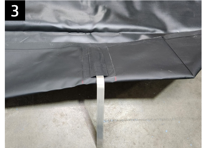
Install brackets into the berm pockets.