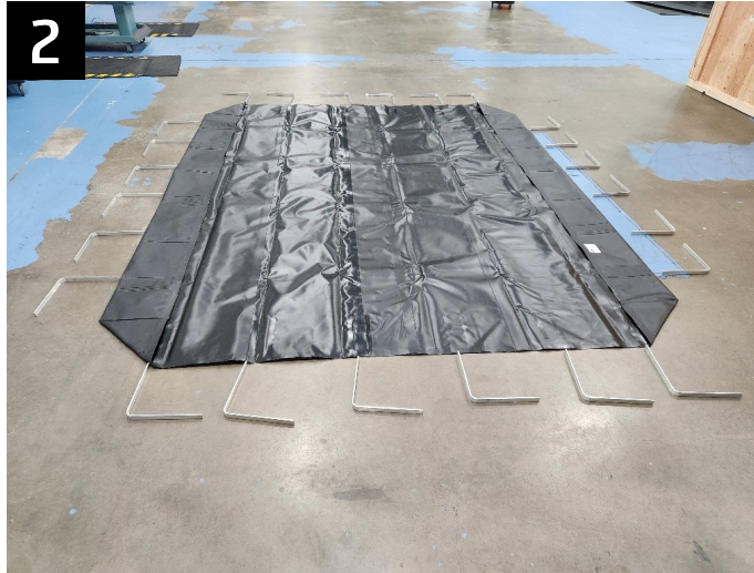
Unfold Berm and place brackets near all pockets as shown.